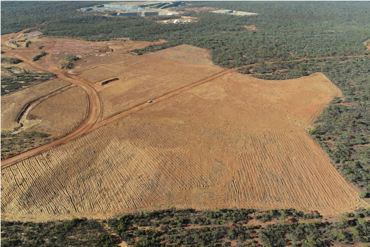
Figure 3 Spargoville Borrow Pit Rehabilitation