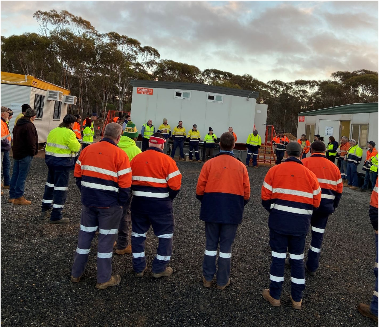
Figure 6 NAIDOC Week Barbeque