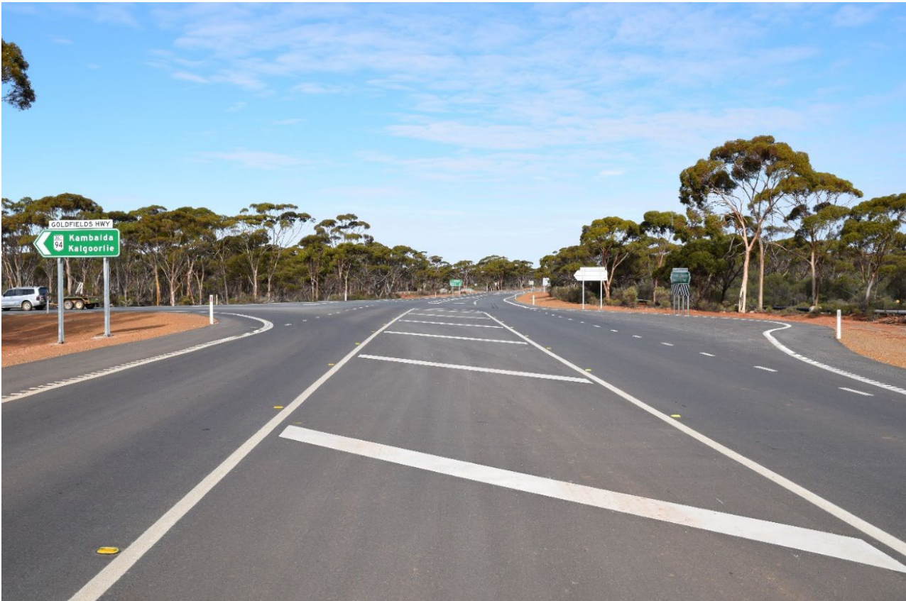
Figure 2 Asphalt Intersection Upgrade at Goldfields Highway and Coolgardie-Esperance Highway

The Project is located within the Shire of Coolgardie, the upgrade is within the locality of Widgiemoolta, an old gold prospecting and mining town with a small population remaining. The Project is approximately 100 km from Kalgoorlie, the nearest major centre. The overall length of the Project is 29.3 km and encompasses two major intersections (Goldfields Highway (Figure 2) and Kingswood Road South) and a railway crossing of which is operated by ARC infrastructure to facilitate the movement of ore between Kalgoorlie and Esperance.