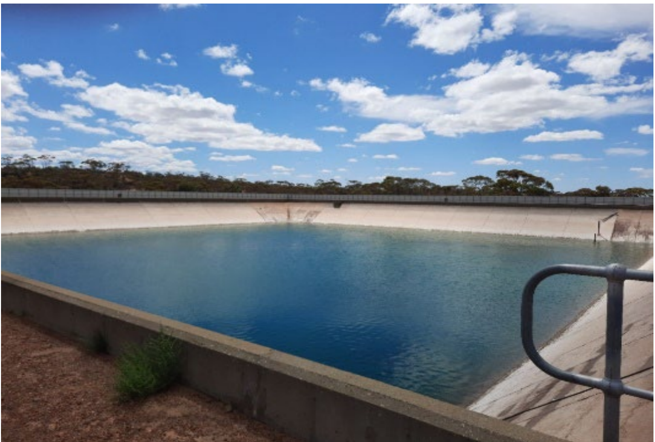
Figure 5 Spargoville Dam

Spargoville Dam (Figure 5) was also identified as a water source. It is estimated that each year the Spargoville Dam loses approximately 24,000 kL of water from evaporation. Recognising the scarcity of fresh water in the region, the Project team implemented the use of WaterGuard to suppress water evaporation. WaterGuard - WaterGuard is a liquid substance which spreads over the surface of water to form a very thin film. WaterGuard is used in food and pharmaceutical applications. An evaporation experiment was developed to monitor the effect of WaterGuard over 2.5 months (29/09/2021 to 15/12/2021). Two metal spill trays with rain gauge were used during the experiment. The trays were filled with water, one added WaterGuard, and located next to the dam. The experiment indicates 13,056 KL (36%) water was saved from evaporation using Waterguard.